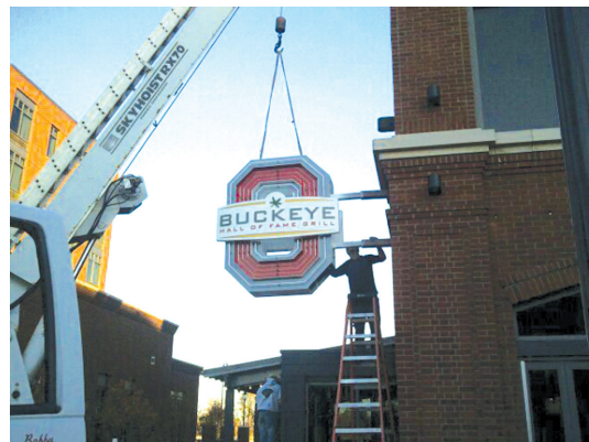
The sign is hung at Grandview Yard's Buckeye Hall of Fame Grill, which features such mementoes as the old iron Ohio Stadium gates.

"You'll see little pieces of things that connect to our past and tradition and are items that people