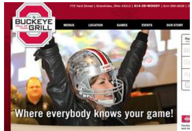
The Buckeye Hall of Fame Grill is closing at Grandview Yard.

Its lease expired and rather than taking an option to stay at the Ohio State University-owned Gateway, it opted to move to Grandview after being approached by NRI.