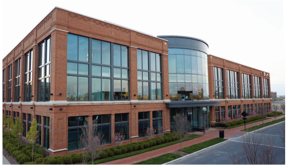
National Realty Investor's 800 Yard Street building at Grandview Yard

However, the exercise work station isn't where all the action happens. Among the most defined spaces in the office is the GBK Hub, which hosts a joke wall, kitchen and foosball table with a panoramic view of some of the yard all set apart from the rest of the office by