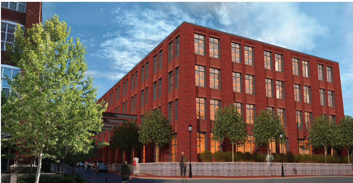
Cameron Mitchell Restaurants is moving its corporate headquarters to the iconic Buggyworks building.