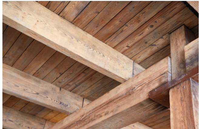
The 114-year-old timber framing is being preserved at 400 W. Nationwide Blvd.

Both buildings are expected to be open by fall. Turner Construction is managing the project. ■