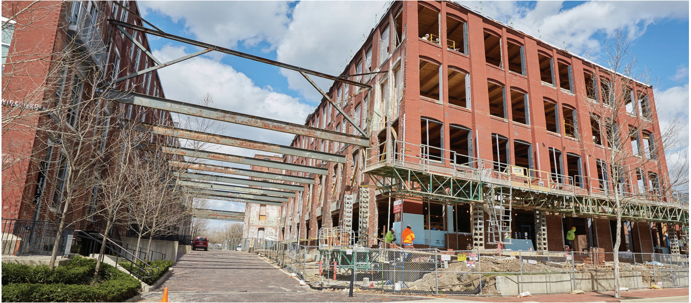
The two historic buildings will bring a combined 145,000 square feet of office space to the Arena District.